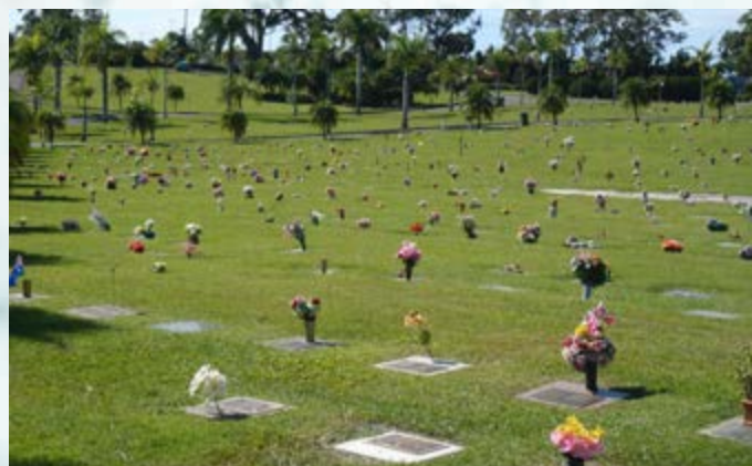
Southport Lawn Cemetery

Plaques or memorial tablets to be placed on these desks cannot be larger than the desk face size. Only our staff are authorised to install the memorial tablet. A permit to construct a memorial tablet must be obtained from the City of Gold Coast (City) commencing on site.