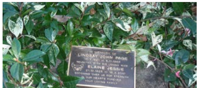
Southport Lawn Ashes Scattering

Additionally, a request for a loved one's ashes to be scattered within cemetery grounds is also available.