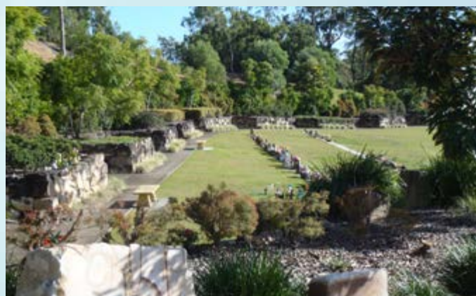
Mudgeeraba Lawn Beam section