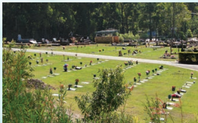
Mudgeeraba Lawn Cemetery