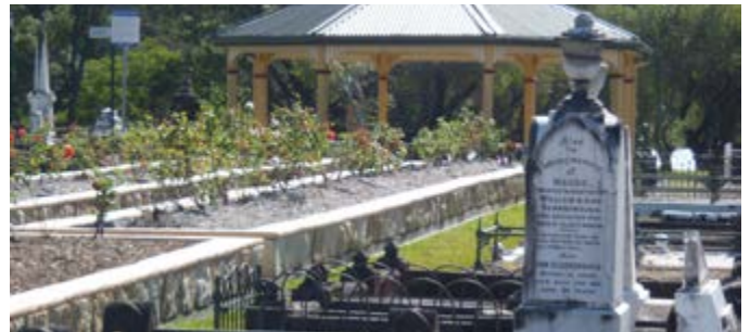
Southport General Rose Garden

Sites are available at Mudgeeraba, Southport General and Southport Lawn Cemeteries. These may be purchased as a single, double or family site (subject to availability). Ashes are interred in the chosen site and a memorial plaque placed over the site.