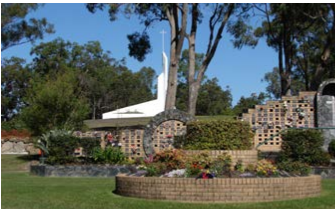
Southport Lawn Granite Columbarium Wall and Ashes Memorial Gardens

Sites are available at Coomera, Mudgeeraba, Nerang, Pimpama and Southport Lawn Cemeteries. These may be purchased as a single, double or triple site (subject to availability). Ashes are interred in the chosen site and a memorial plaque placed over the site.