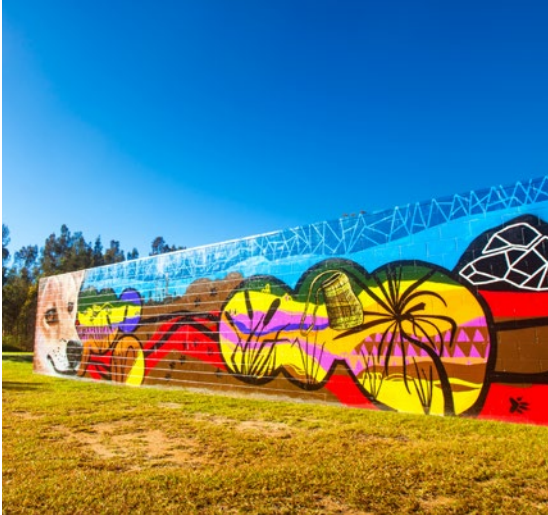
Graffiti prevention mural by Libby Harward